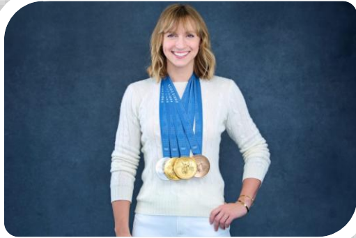
Katie Ledecy: Going for Gold